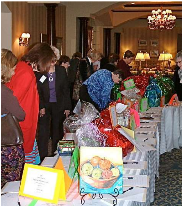
Checking out the Silent Auction items

The business location in "( )" is where the gift certificate was donated from. The "(?)" is where I think they came from. These are businesses with multiple locations, and the gift certificates are good at any of their locations.