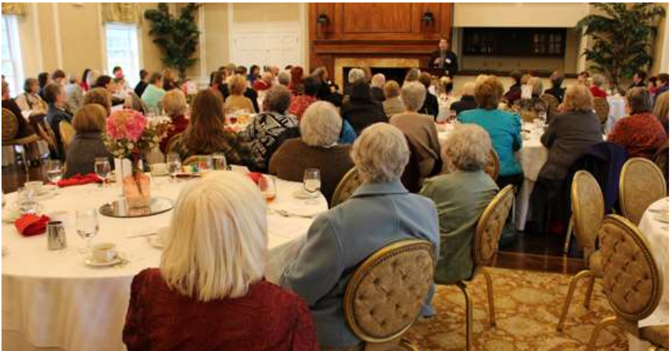
Daniel Stashower tells how Allan Pinkerton foiled a secret plot to murder Abraham Lincoln.