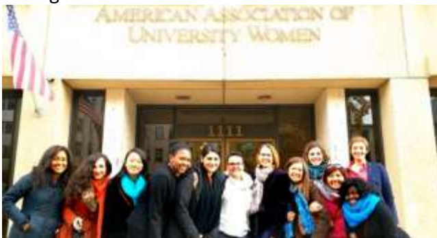
1111 Sixteenth Street, NW.

We will meet in the parking lot at University Mall at the intersection of Braddock Road and Route 123 at 9:30 to be sure to get there on time. Olga Burns and Gale Rogers and other volunteers will drive, and it will take 45–50 minutes to get there and park. We need to know ASAP how many plan to attend so that Caroline and Suzanne and your drivers can plan. Please let us know if you are willing to be a driver.